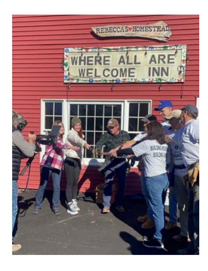
The crews from Rebecca's Homestead, George to the Rescue and Habitat for Humanity Northwest New Jersey put their hammers in, ready to kick off the beginning of the renovations!