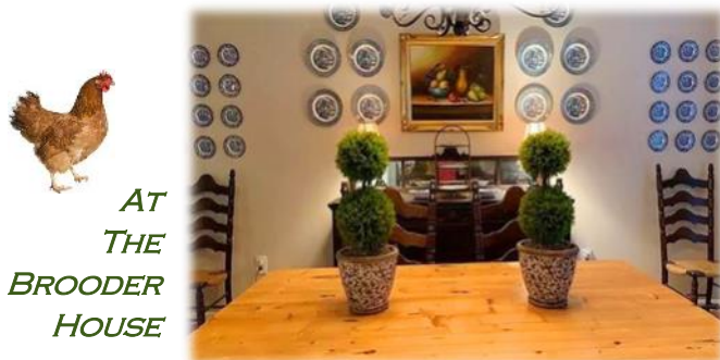
AT THE BROODER HOUSE