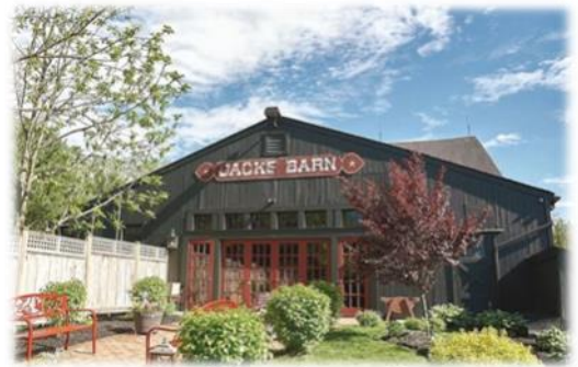
Exterior of The Loft at Jack’s Barn 1487 Route 31 in Oxford, New Jersey

In May of 2021, they purchased a newer house adjacent to Jack’s Barn, The Brooder House , named for the cozy place on a farm where chickens roost and lay their eggs. They transformed it into additional lodging for guests in just 4 months. Many distinctive furnishings were bought at the ReStore.