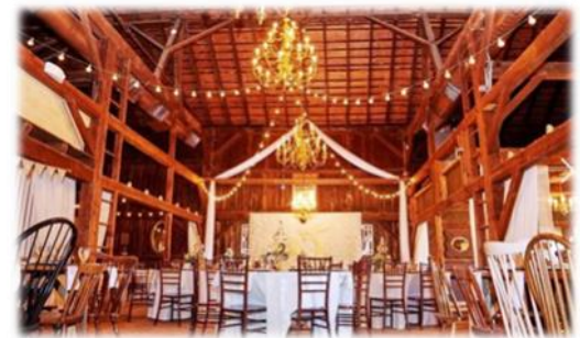
The Loft at Jack’s Barn, dressed for a wedding.