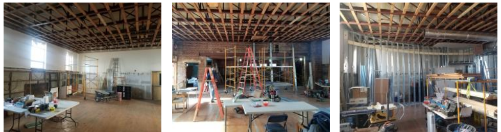
Photos showing space progression from a rectangular to a curved space.